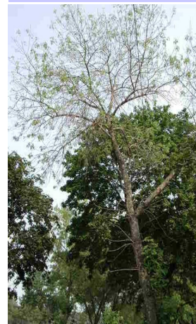
Thinning tree canopy