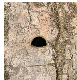
D-shaped exit hole

To exit the tree, adults chew holes from their chamber through the bark, which leaves a characteristic D-shaped exit hole. Immature larvae can overwinter in their larval gallery, but can require an additional summer of feeding before emerging as adults the following spring.