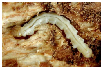
Wood boring larva

A typical female can live around six weeks and lay approximately 40–70 eggs, however, females that live longer can lay up to 200 eggs. The eggs are difficult to see as they are deposited between bark crevices or under bark scales on the trunks and