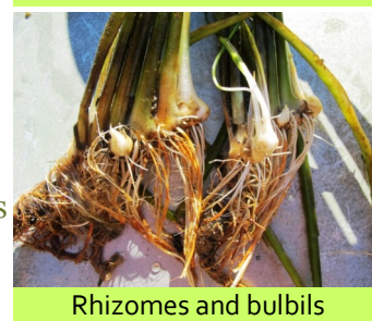
Rhizomes and bulbils