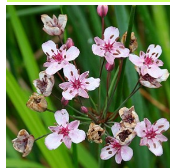
Cluster of flowers